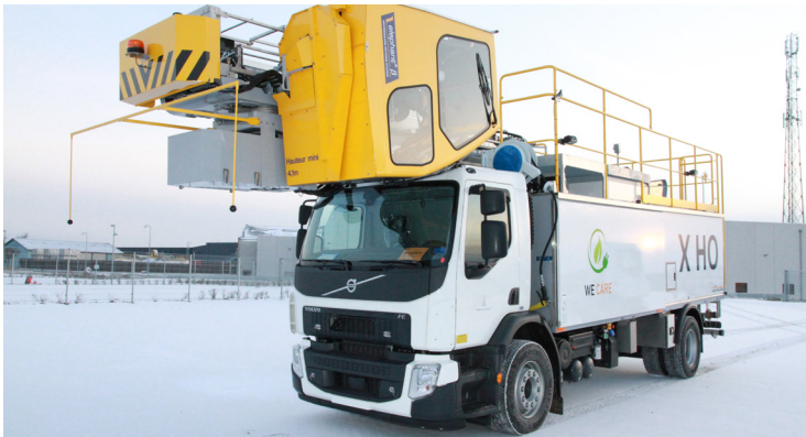
The Elephant® e-BETA looks like other BETAs from the outside