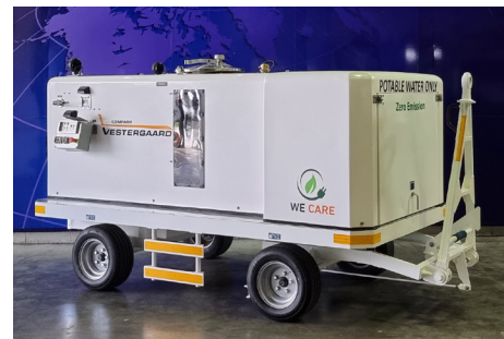
Unit with fiberglass cover