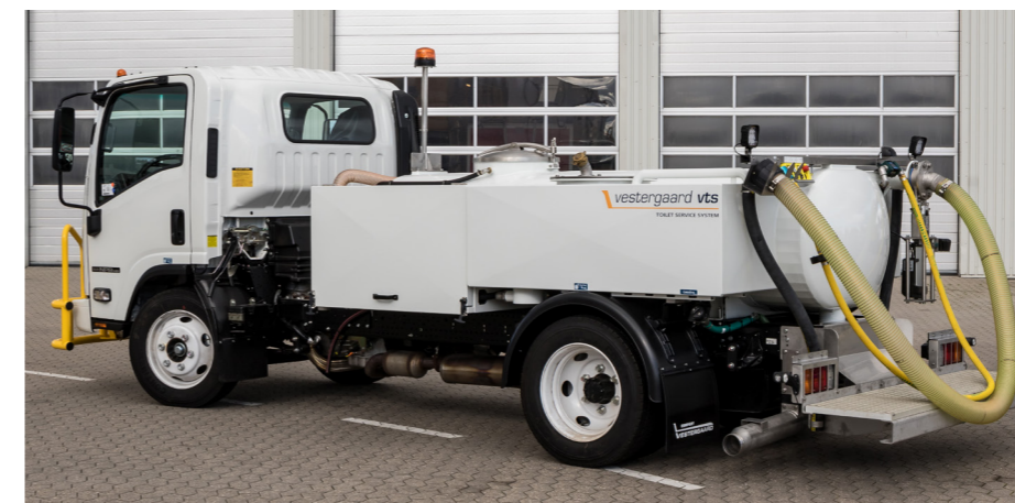
The water and toilet service units are designed to fulfill customers' preferences and specific needs, and are built exclusively using first class components.

The unit complies with the strictest relevant industry standards of health and safety. Risk of collision between service truck and aircraft when positioning is minimized as operators basket can be adjusted horizontally.