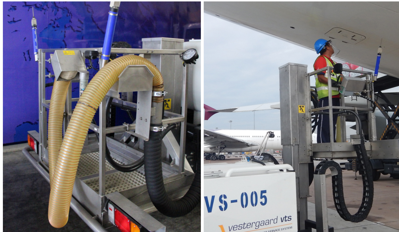
The Vestergaard Water and Vacuum Toilet Service units are equipped with an elevating basket. The spacious basket – with plenty of room for two persons – is easily entered from the ground level.