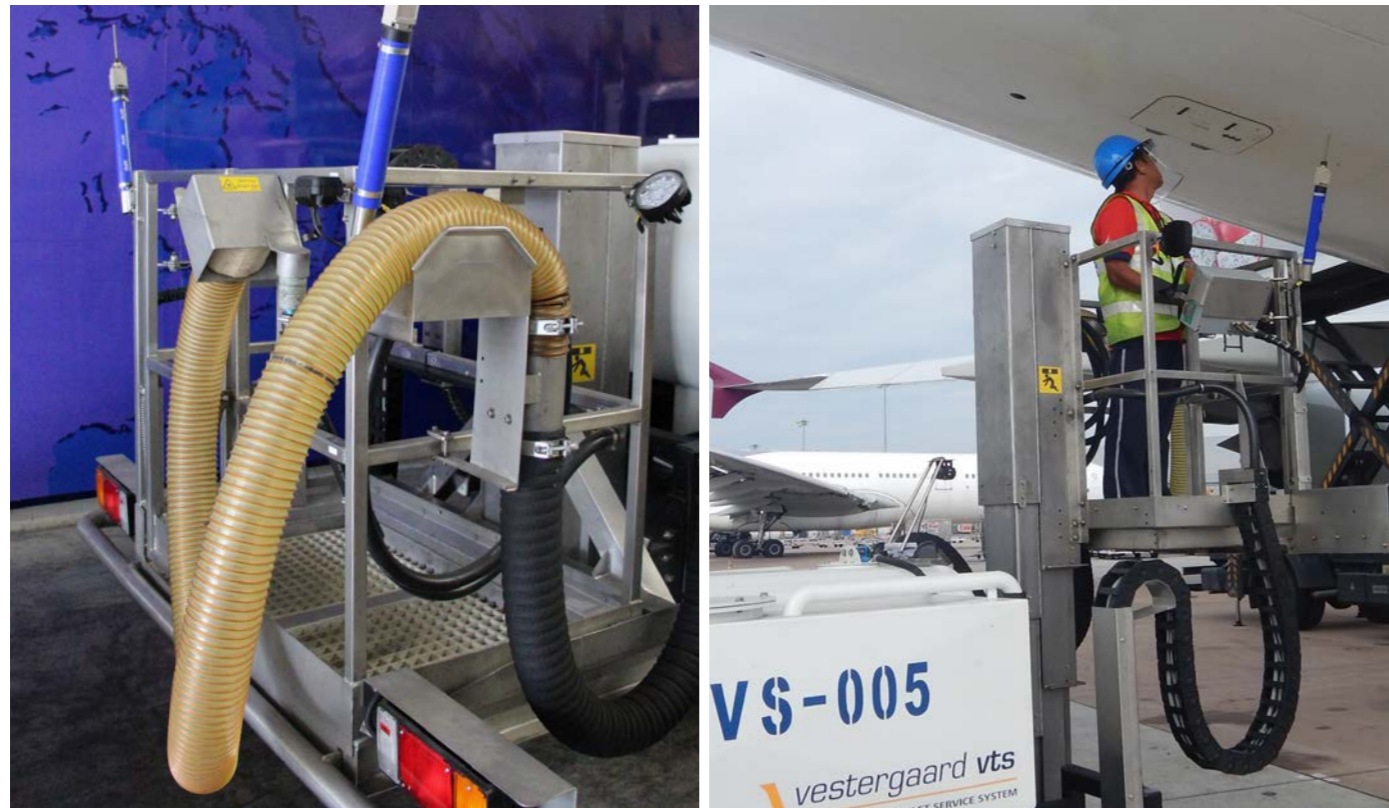
The Vestergaard Water and Vacuum Toilet Service units are equipped with an elevating basket. The spacious basket – with plenty of room for two persons – is easily entered from the ground level.