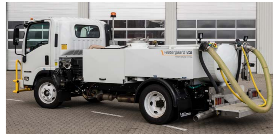
The water and toilet service units are designed to fulfill customers' preferences and specific needs, and are built exclusively using first class components.

The unit complies with the strictest relevant industry standards of health and safety. Risk of collision between service truck and aircraft when positioning is minimized as operators basket can be adjusted horizontally.