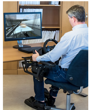
Transportable table version.

For questions and requests for further information please contact: