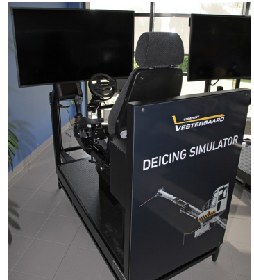
Full cabin mock-up version.

The Elephant® Beta simulator is a state-of-the-art PC-based training tool.