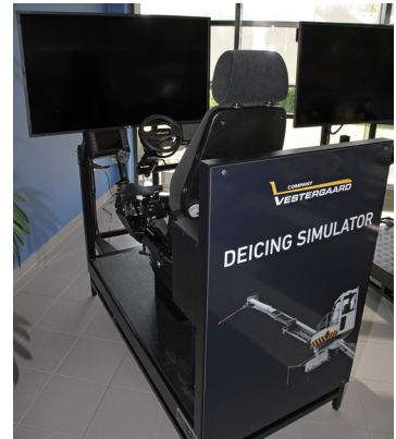
Full cabin mock-up version.

The Elephant® Beta simulator is a state-of-the-art PC-based training tool.