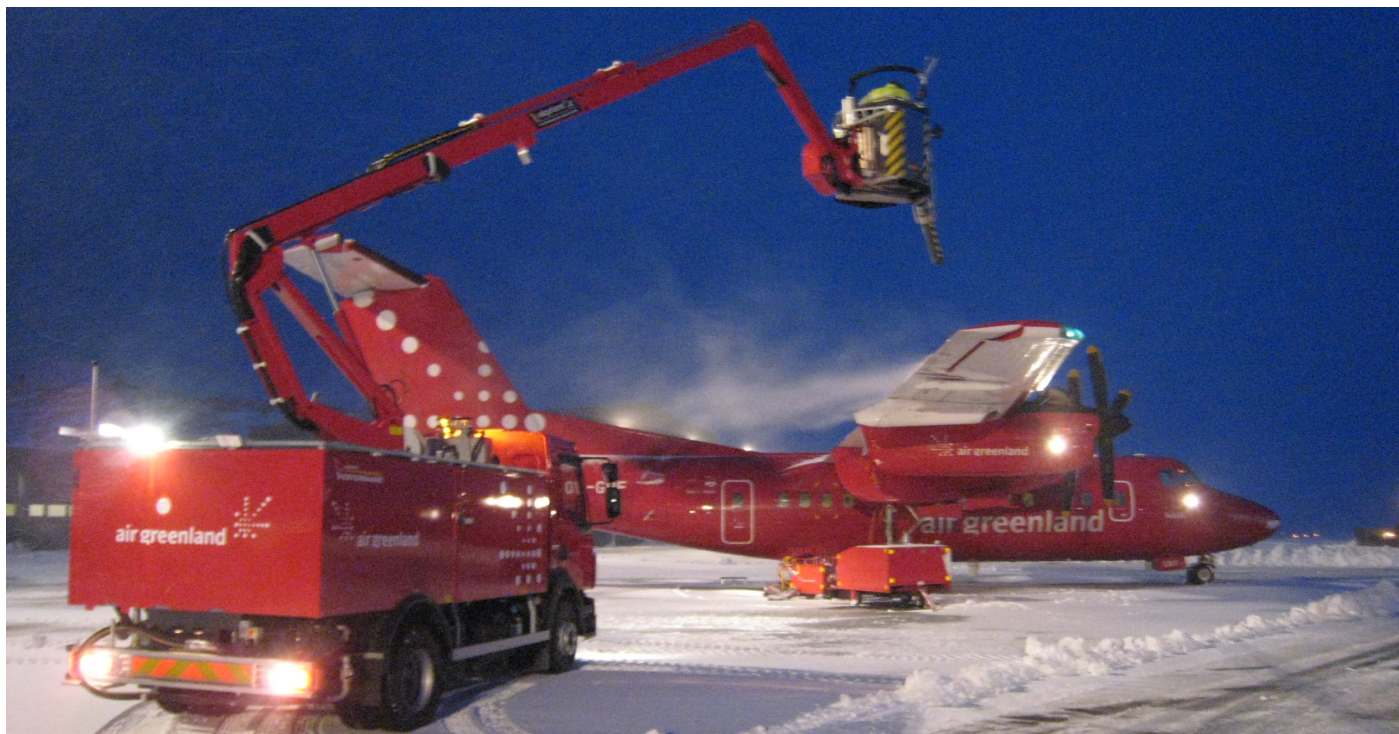
The Elephant ® My provides the customer with the Forced Air System, which ensures highly efficient snow removal with the maneuverable nozzle and the shortest possible blow distance.

The design of the Elephant ® My is based on Vestergaard Company experience and technology proven reliable over the years. The Elephant ® My is built on a standard truck chassis and can be equipped with a vast array of options to increase its efficiencies while still keeping it simple.