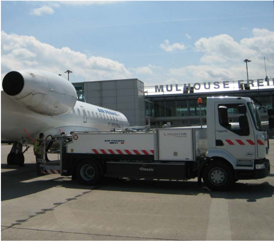
The water and toilet service units are designed to fulfil customers' preferences and specific needs, and are built exclusively using first class components.

Using vacuum evacuation, only one flush is needed, thus avoiding undesired leakages and formation of blue ice at aircraft panels.