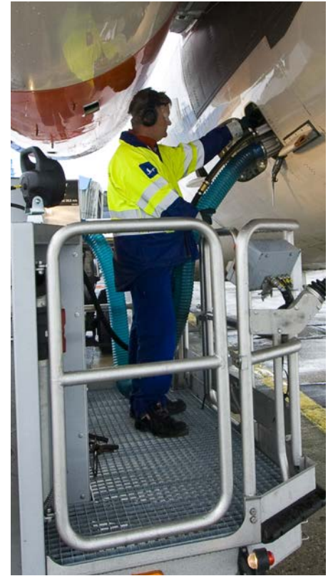
The Vestergaard Water and Vacuum Toilet Service units are equipped with an elevating basket. The spacious basket – with plenty of room for two persons – is easily entered from the ground level.